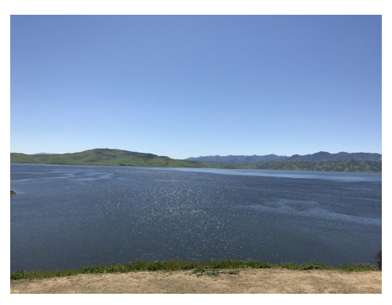
The vast, 100% full San Luis reservoir, 84 square miles, holding 2.0 MAF.